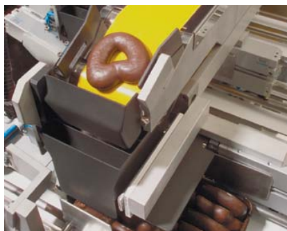
Collection of the gingerbread and loading of the trays

Tray pack sizes: L B H 230 145 40 mm other dimensions on request