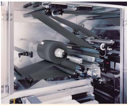
Feeding of film materials for the manufacture of bicells