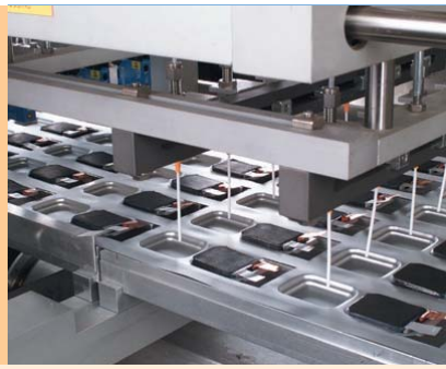
Dosing of electrolytic liquid in a nitrogen atmosphere