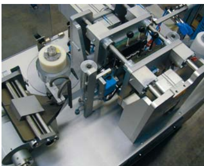
Overall view of the bag manufacturing unit