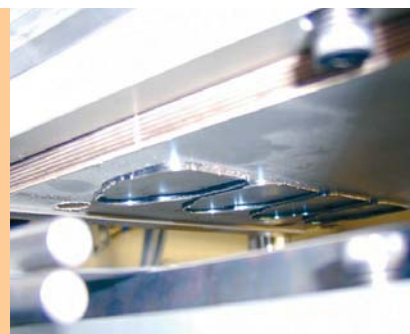
Die-cutting of the outer contour