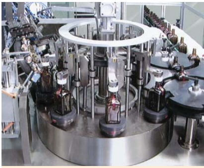
Application of sealing marks by function stations arranged about a rotary unit