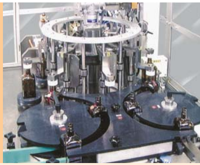
Infeed and outfeed stars provide for smooth product flow in the processing of bottles