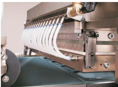
Molding of the base elements for test tube packs