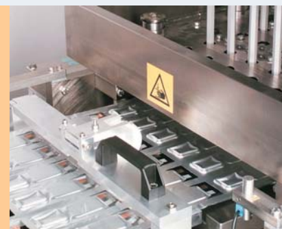
Form cut for sealed package sheet