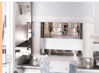
Sealing of the base and cover elements