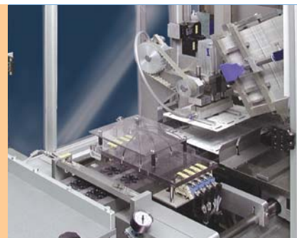
Feed of the carrier cardboard and insertion into the product chain