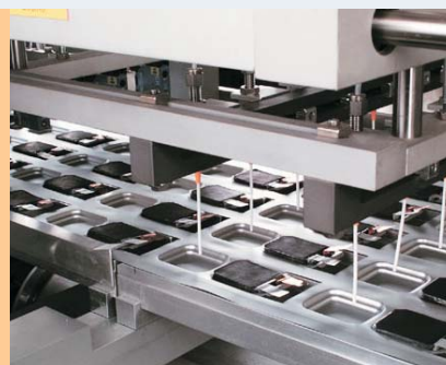
Dosing of electrolytic liquid in a nitrogen atmosphere