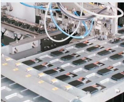
Loading of batterie stacks into the formed backing foil

i You will find further informations in our brochure "Customized Solutions"