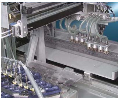
Transfer of round cell batteries into the thermoformed film web

You will find further informations in our brochure "Customized Solutions"