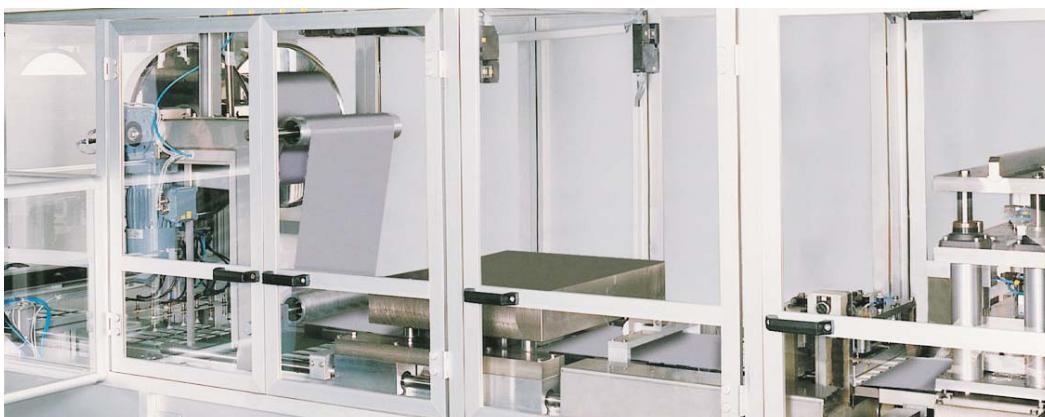
PFM – the solid line platform for the production of formed foil packages

All specifications in this data sheet are without obligation and are subject to change!