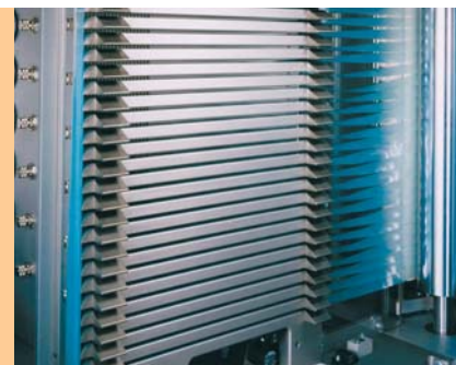
Storage of the film webs